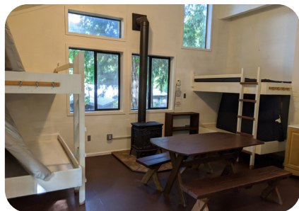
Typical Cabin Interior

Cabin placement takes place prior to the start of each session, and is finalized the week prior to camp. If your camper has a friend attending the same session, we ask that you limit the number of cabin mate requests to 1. We cannot guarantee all requests will be met. This will help ensure that camp is a welcoming place where every camper feels included and can make new friends. Please note: this must be a mutual request to be honored, and campers must be within one grade level or 18 months in age. If a request is made to place campers of greater age spans together in a cabin, the older camper will be placed in the younger cabin.